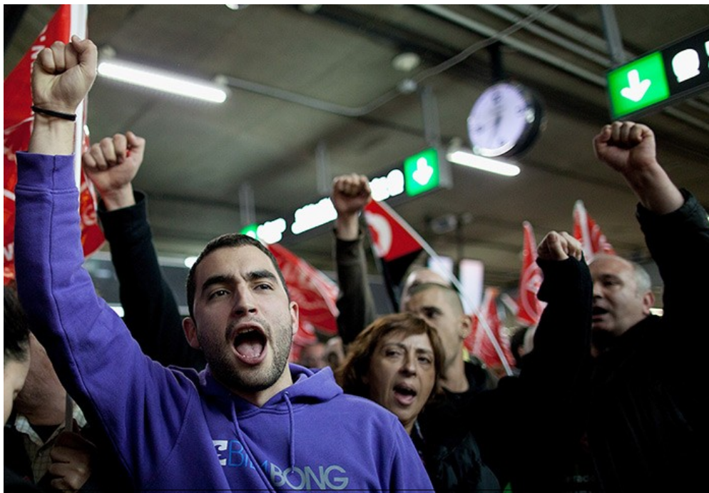
An image from the 29th March General Strike in Spain called by the CNT, CGT and SO anarcho-sindicalist unions

We have been repeatedly told that we are in an economic downturn, a recession, that we are all being hit hard by the current crisis. We all, of course, have to put up with job losses, worse terms and conditions, a lack of funds for education, healthcare, benefits and services. Austerity is the price that we have to bear in order to turn the economy around. It is simply an economic reality that we are powerless to change.